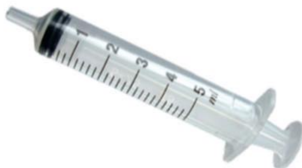
Syringes for aspiration