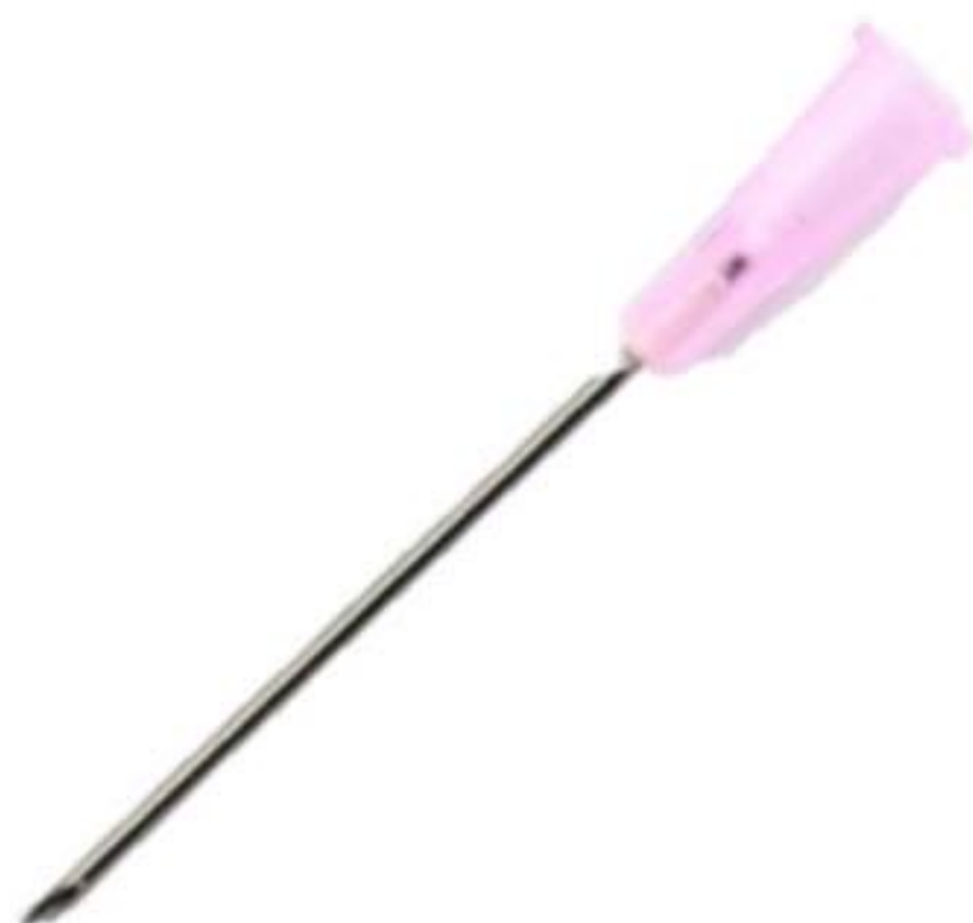
18g Needles Cavernosal Access