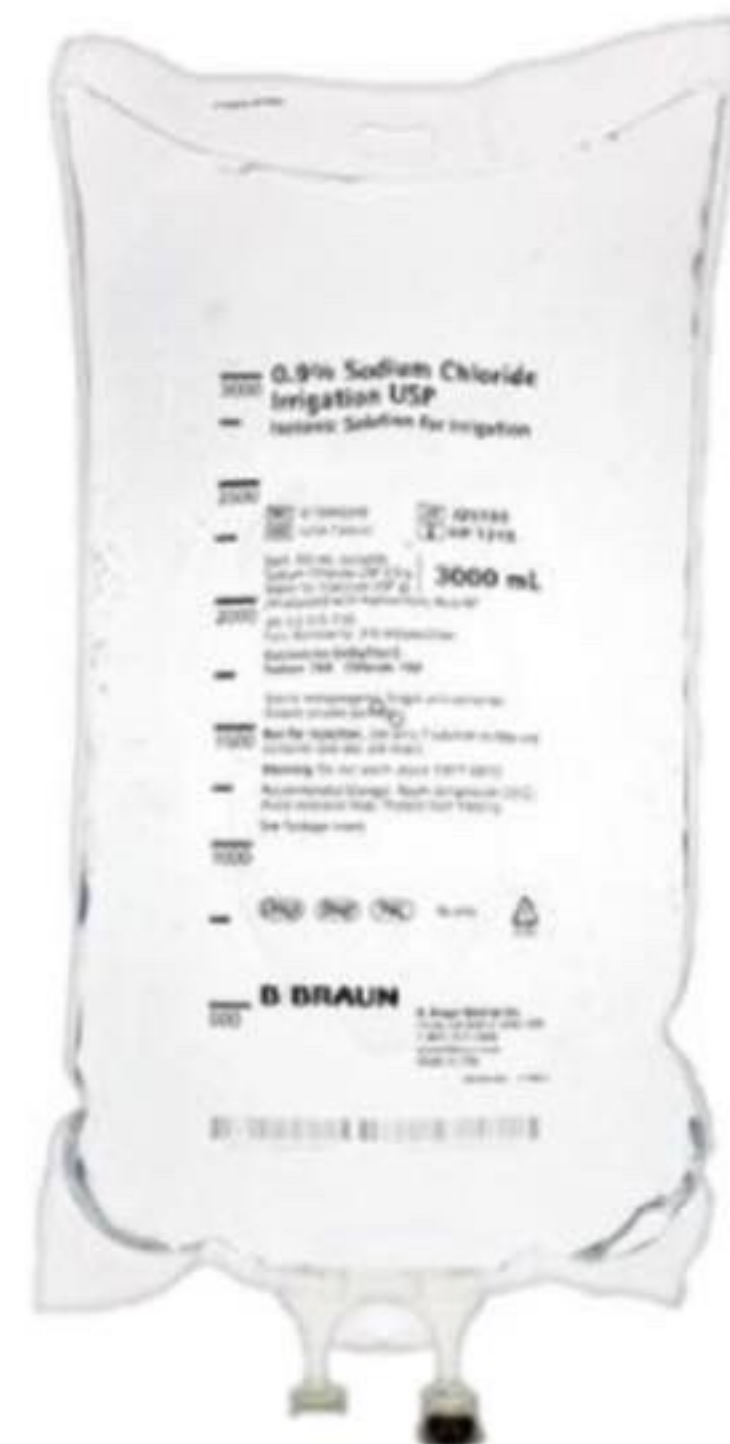
250 cc NS for irrigation