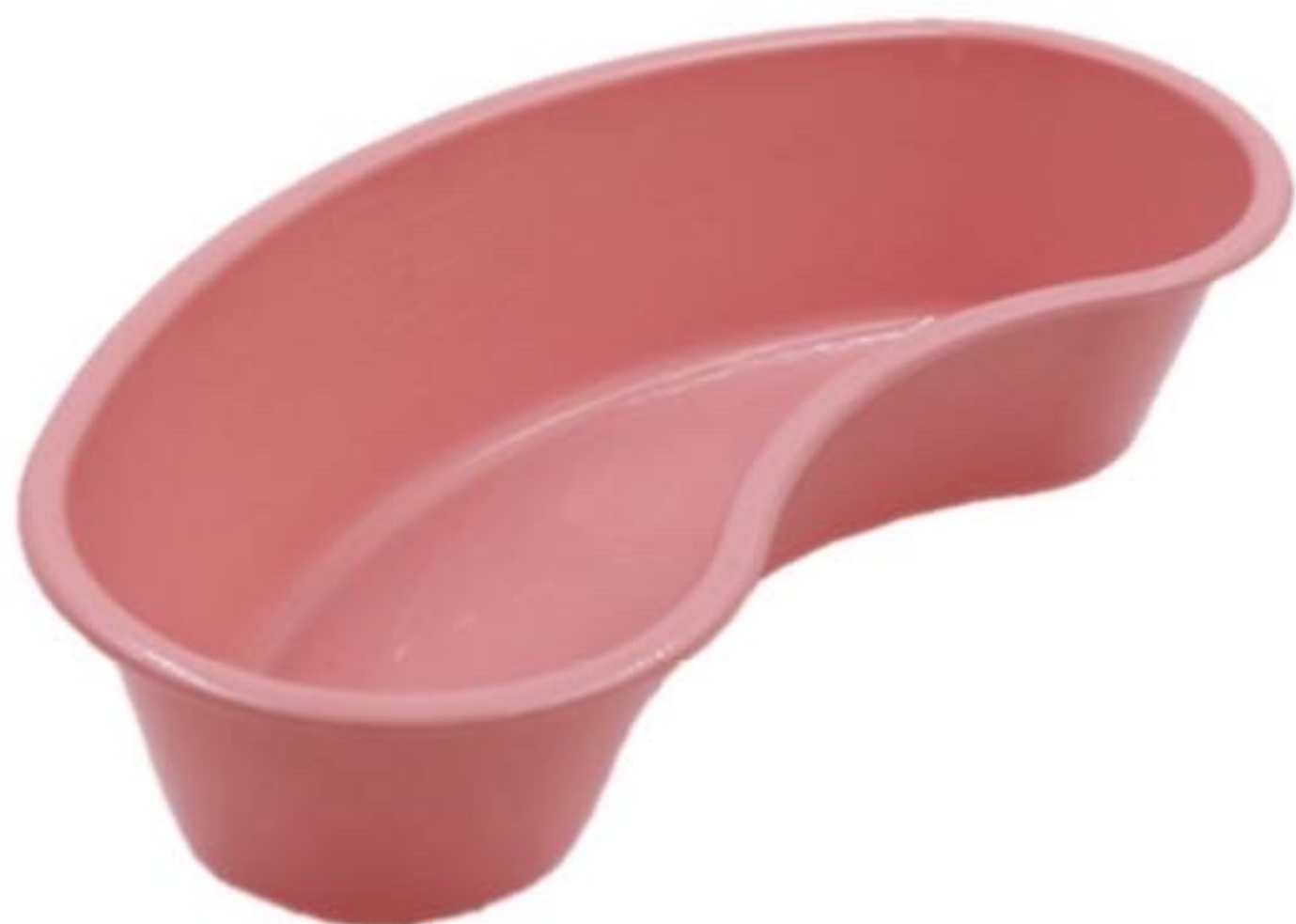
Emesis basin to collect blood