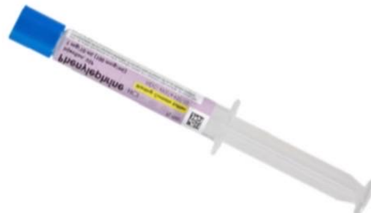
Phenylephrine 100 mcg/ml