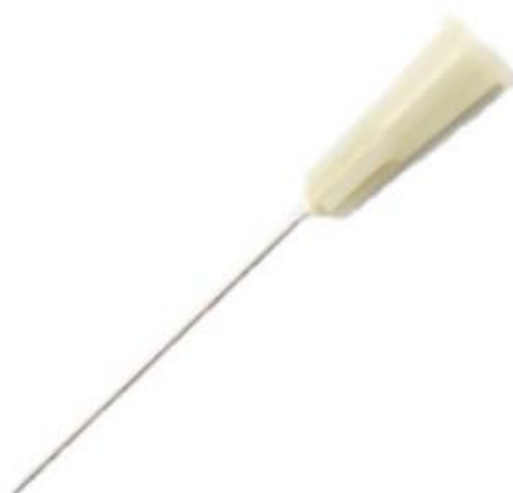
27g Needles Penile Block